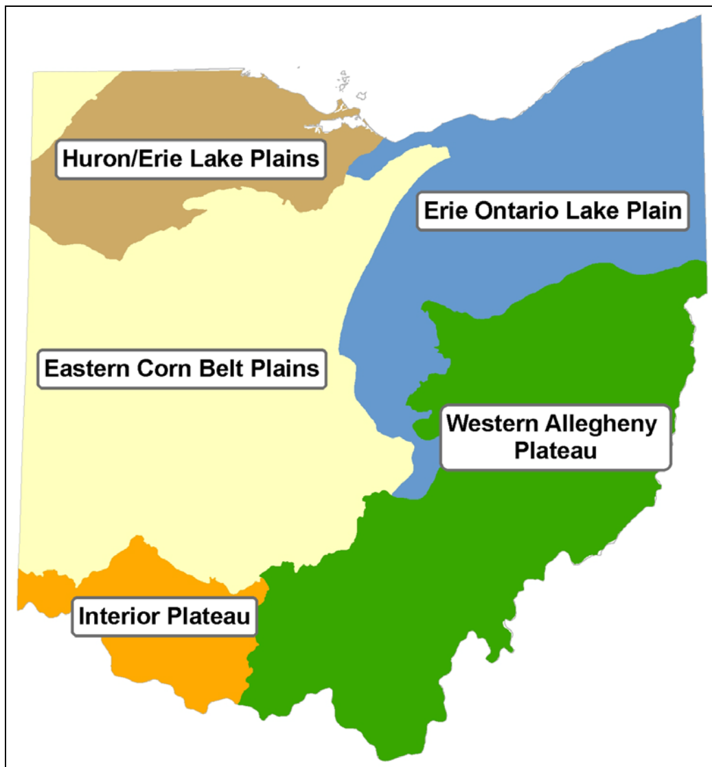
Figure C-2. Ecoregions of Ohio.

The three multi-metric indices used by Ohio EPA are the Index of Biotic integrity (IBI), the Modified Index of well being (MIwb) and the Invertebrate Community Index (ICI). These three indices are based on species richness, trophic composition, diversity, presence of pollution-tolerant individuals or species, abundance of biomass, and the presence of diseased or abnormal organisms. The IBI and the MIwb apply to fish; the ICI applies to macroinvertebrates. Ohio EPA uses the results of sampling reference sites to set minimum criteria index scores for use designations in water quality standards. Table C-3 displays the criteria for the various aquatic life use designations in different ecoregions of the state while Figure C-2 is a map of the ecoregion boundaries in Ohio.